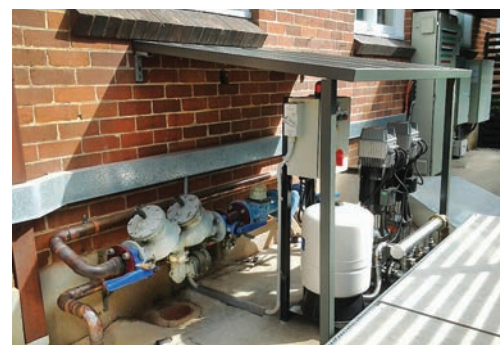
The pressure boosting pumping system installed and operating.