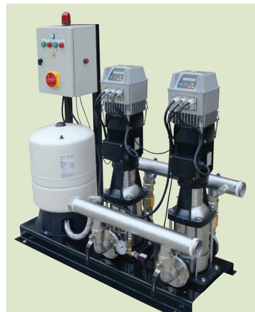
Pump system assembled, factory preset, tested and ready for despatch.