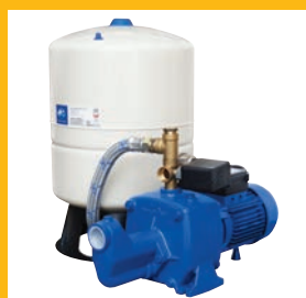
LARGE PRESSURE SYSTEMS