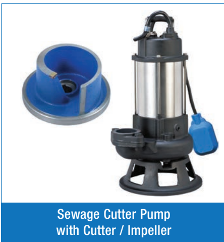
Sewage Cutter Pump with Cutter / Impeller

Do you have a requirement for a sewage submersible pump? If so call the pump specialists today! Ph: 1300 662 787