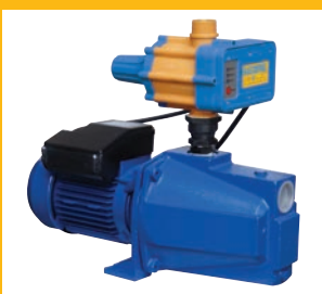
SELF PRIMING PUMPS