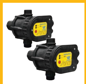
PRESSURE PUMP ACCESSORIES & REPLACEMENT CONTROLLERS