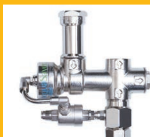
ACQUASAVER RAIN TO MAINS DIVERIONS VALVES