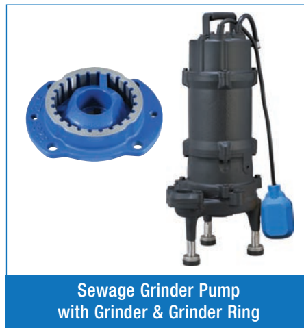
Sewage Grinder Pump with Grinder & Grinder Ring

TIP NEVER install pipework that has a smaller internal diameter than the solid passage of the pump! Every sewage pump has a solid passage, which is the maximum size of solid that can pass through the pump. Obviously if the pipe size is smaller than the solid passage of the pump, the pipework will block / clog up.