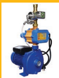
RAIN TO MAIN SYSTEMS